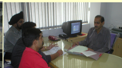
Key Dealer Unit of Sales Tax