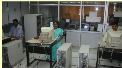
Server Room of Sales Tax